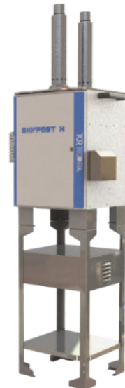
Skypost X DUO TABLE

*Also available in the version single channel