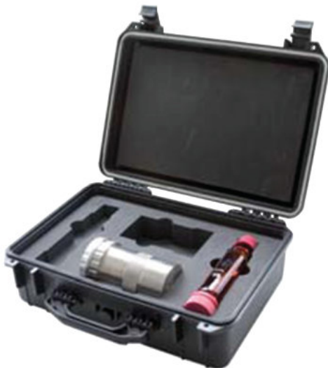
Transport case for filter holders